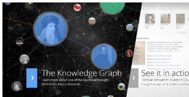
Figure 5: The opening page of Google's Knowledge Graph [30]

Semantic Web Technologies are destined to be integrated into new type of large scale applications. One only has to look at what Goggle's Knowledge Graph is capable today, to appreciate the significance of this development.